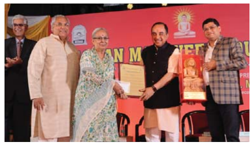
Bhagwan Mahaveer Foundation presented the 20th Mahaveer Award for 'Excellence in Human Endeavour'