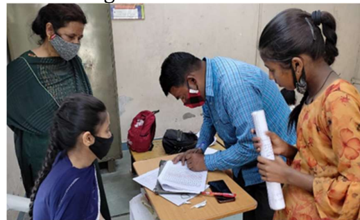
Parent Teacher Meeting

The average reach of PTMs was 97.92% of parents.