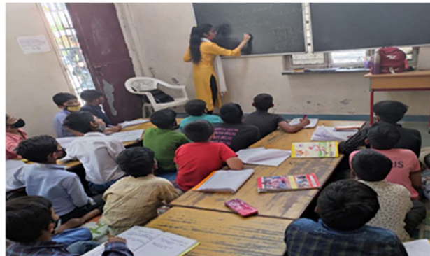
Regular Offline classes

An internal assessment was conducted to ascertain the learning level of each child. The results showed that the student's learning levels have been negatively impacted to a significant degree.