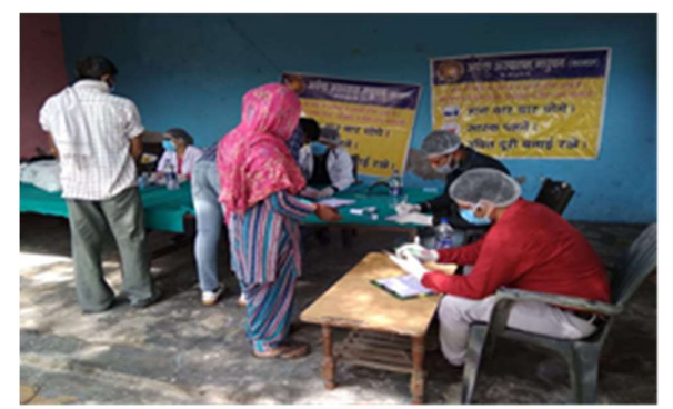
94% of the population of 100 villages received the 1st dose and 77% received the 2nd dose by end Dec. 2021.

Building a "Vaccine Wall" Against Covid-19: Due to the Covid epidemic, some villages in Arpana's 100 target villages had to be sealed off to rescue the epidemic. Arpana offered to join with the government team to build a "Vaccine Wall" against Covid in the 100 villages. Soon, the Arpana team, local Headmen, and Government village workers joined the official Government effort to fight Covid.