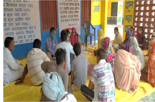
DPO meetings are changing the lives of PwDs!

They get information on government schemes and benefits in the monthly meetings of their DPOs. They have built up savings and have access to micro-credit loans. They took 1,874 loans for income-generating activities and other purposes.