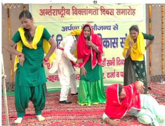
A role play sharing real life stories of PwDs