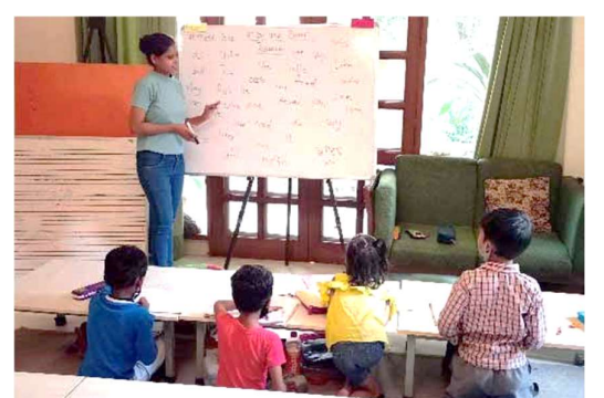
Offline (Contact) Classes

• Fortunately, most of our students this year had access to smart phones, but there were some problems because of occasional connectivity issues.