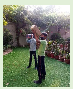
Pin Hole Cameras

We have provided our teachers with specialized training so they can explore various teaching strategies to improve the skills of the students. Our staff arranged some interesting activities like-Pin Hole Cameras, Water filter and many more.