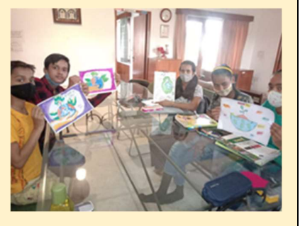
Earth Day - Class 8