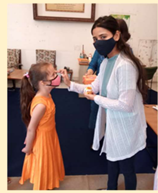
Applying Chandan Tikaa On Holi

The Commemorations of Republic Day, Holi, Independence Day, Diwali, and Christmas, were celebrated as the lockdown was eased.