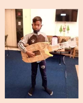
Best Out of Waste