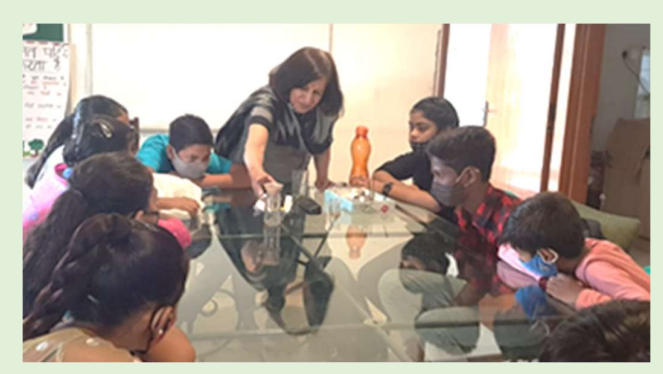
Students take interest in science experiment