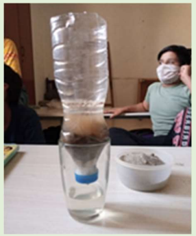
Water Filter- Class 7

We have provided our teachers with specialized training so they can explore various teaching strategies to improve the skills of the students. Our staff arranged some interesting activities like-Pin Hole Cameras, Water filter and many more.