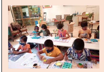
Diwali - Diya Making

This builds confidence and enhances their talent.