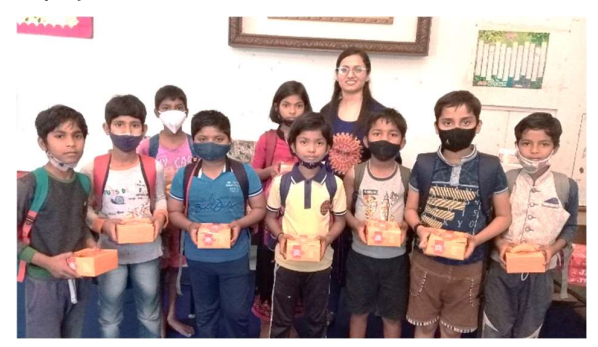
Children receive Mini Meal Boxes on Holi

Speaking in English is encouraged here. Moreover, the committed team of educators used methods like audio and video formats for virtual learning to spread the material via WhatsApp groups to help students.