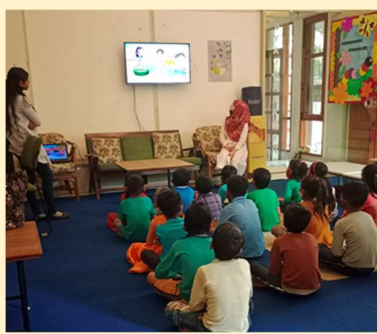
Story Telling on Holi