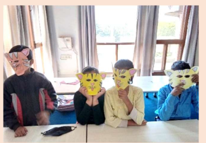
Story Telling and Play- Class 3