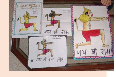
Poster of Hanuman Ji in the shape of the Swastika