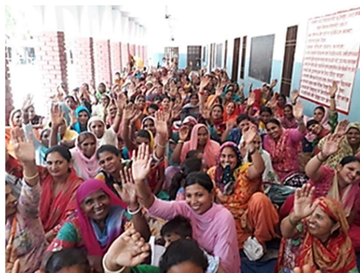
Animated quiz session after the role play and training on waterborne diseases in village Nagla Megha.

Over 50 SHG trainers, constantly built up through regular training, conducted these intensive, village-based health awareness events. They learnt and practiced songs, helped, script role plays and flash cards, to present symptoms of diseases and stressed importance of early referral.