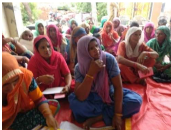
Discussing the evils of alcoholism

The village environment has improved, molestation, harassment and violence has deescalated, liquor is sold only in licensed stores outside the village