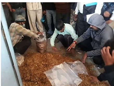
Trainees learn to prepare soil for mushrooms

On 12 th December 2018, eight SHG members with partners were sponsored by Arpana for a 4-day mushroom cultivation training program in the Murthal Mushroom Cultivation Centre including an exposure to a successful mushroom farm during their course.