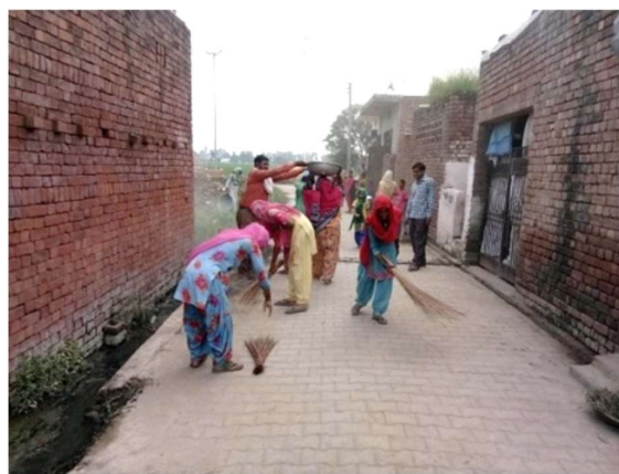
SHG women with other village folk conduct sanitation drive