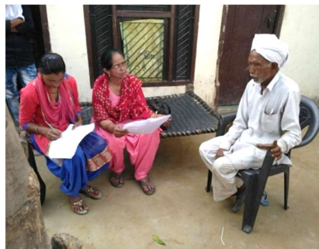
Arpana community workers and SHG leaders conducted surveys in villages Randoli and Kamalpur

Arpana with the kind support of partners has worked intensively with SHG women and Panchayats in 10 Panchayats from 2016-18. Training sessions were organized for elected members to inform them of their roles and responsibilities and the government processes to have plans passed etc. Women were also educated and mobilized to take part in Gram Sabha.