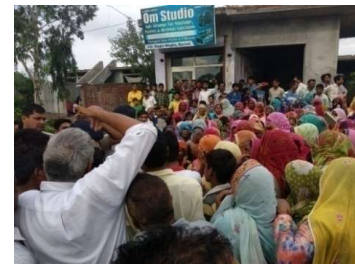
Closing liquor vendor shops