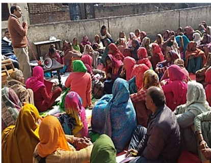
Awareness camp on Prime Minister Accident Insurance Schemes