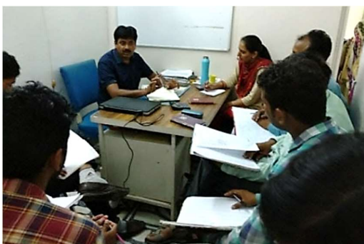
Review session with Audit team

The outreach audit team checked approximately 824 SHGs each month. The correct financial data was uploaded on the computer so that updated status of the groups and individual members is available.