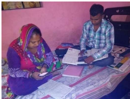
Auditing SHGs & uploading financial data