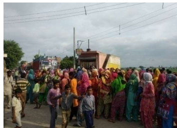
The rally women with a mission!