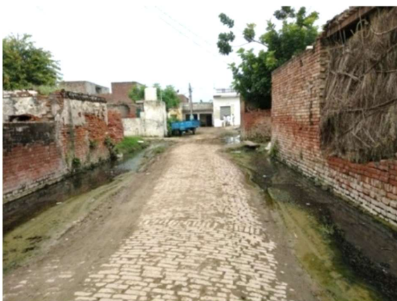
Before working group formed: Dirty lanes, overflowing drains