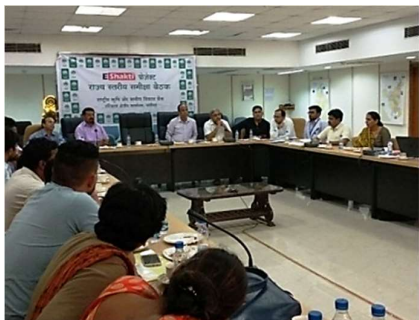
NABARD officials and agencies at state level Review