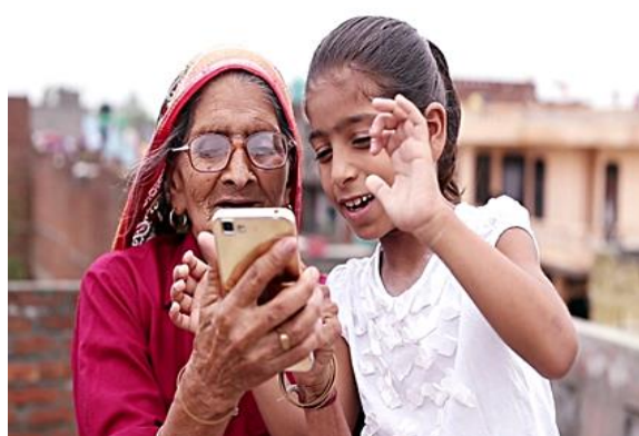
A senior SHG member listens as her grand daughter reads out a message from Arpana