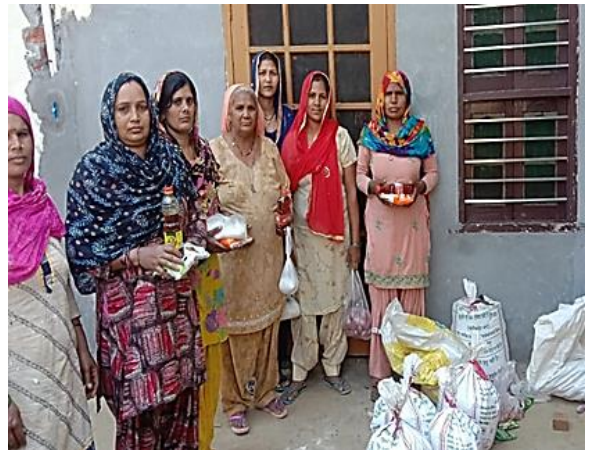
SHG women collect donations and purchase rations for poor and needy families