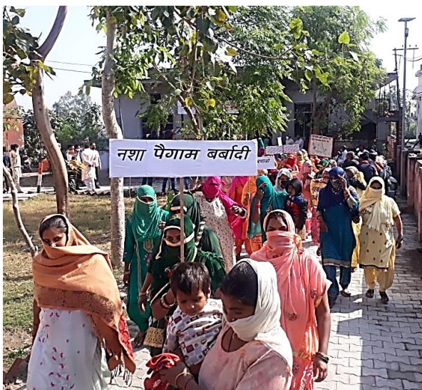
SHG women lead a rally against addiction in village Badagaon