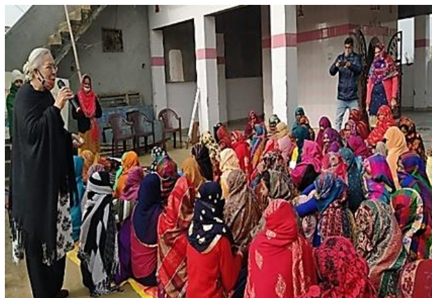
Women from all 8 self help groups of Sirsee gather, to learn about the evils of substance abuse