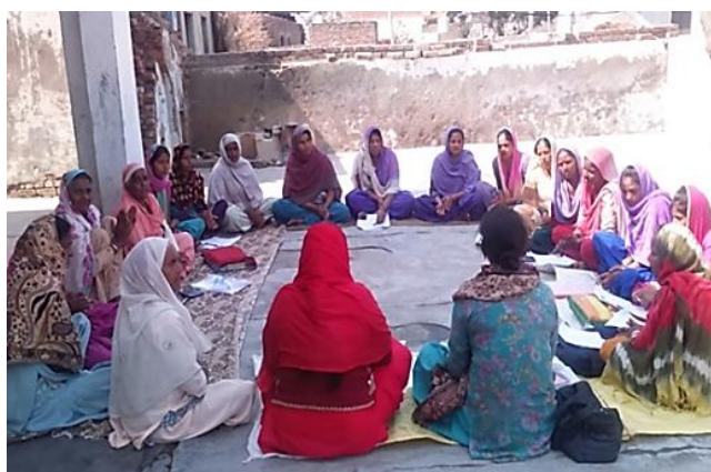
Meeting of representatives of SHGs in Nut Majra

On 23 rd March, a workshop was held for 100 members of 9 new SHGs from Kundkalan and Bajidpur villages, hosted by the 130 members of 7 robust SHGs of village Chundipur.