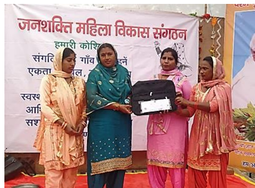
Gifting procedural kits to new Tikri SHGs

They shared their own experiences, encouraged the new members, discussed how to make the SHGs effective and served them all a huge feast!