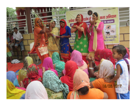
SHG volunteers playing role play on water born diseases

In June, a campaign to prevent seasonal diseases was carried out in 85 villages through 102 street meetings, using role plays, songs, banners and flash cards. 743 Self Help Groups played lead roles and 8,486 women attended these meetings.