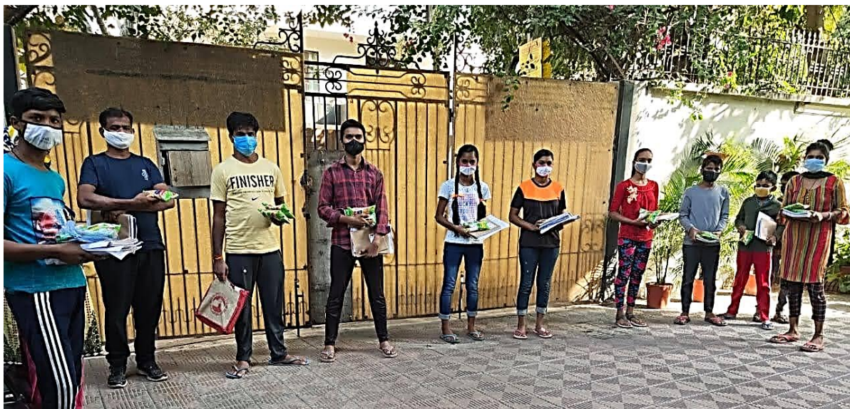
Students receiving Scholarship incentives, prizes and rations during the Covid pandemic