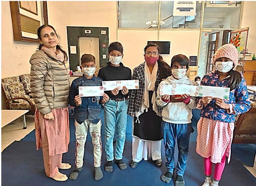
A few of the scholarship recipients